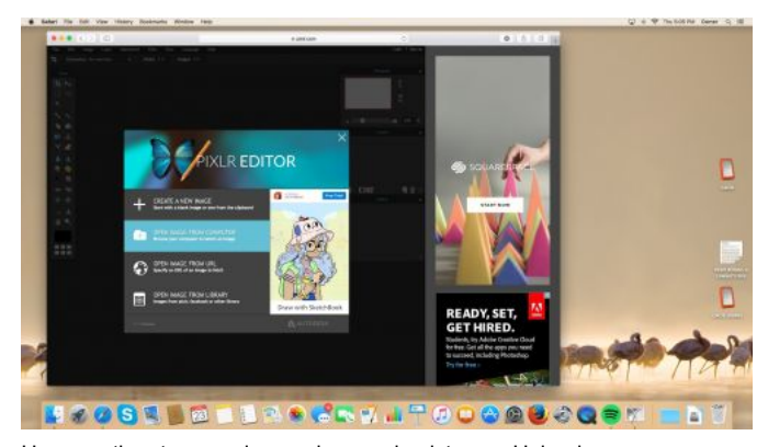
Here are the steps again, one by one, in pictures...Upload...